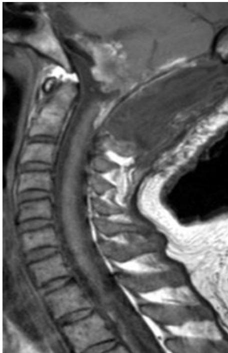
Fig 3. Postoperative Magnetic Resonance Imaging in T1 sequence in which an absence of cystic tumor lesion at the level of the occipitocervical junction is showed.

Surgical treatment remains the treatment of choice. As Vasquez ET al. 16 reports, these cysts can relapse, so that total resection must be achieved in all cases, an objective that is achieved with complete resection of the cyst wall.