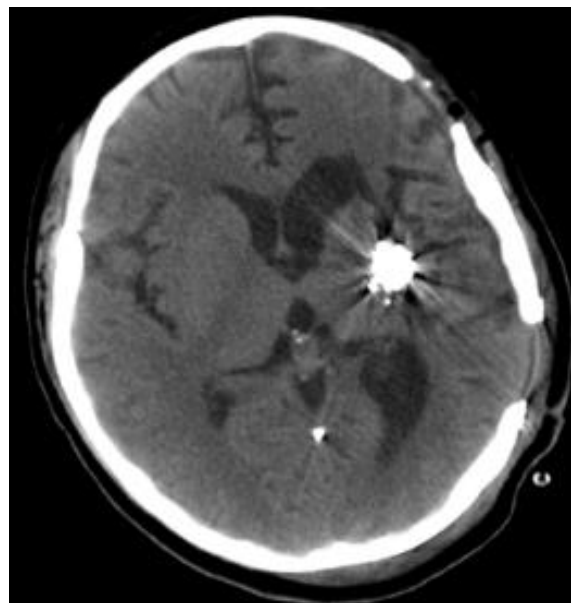
Fig 2. Brain CT after cranioplasty